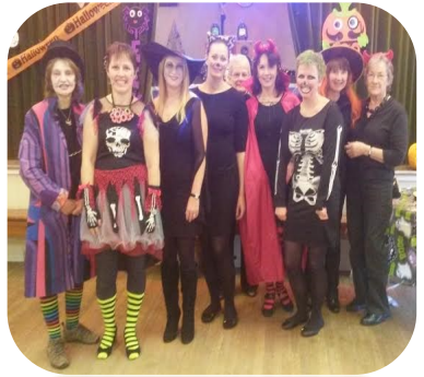
The Committee in Fancy Dress

The over 60s were treated to a 3 course meal and entertainment by "Zing" in November. It was a very social evening with time for everybody to have a catch up with friends and neighbours. The committee will be planning a trip for summer 16.